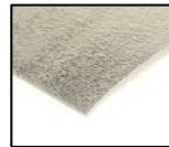
2mm or 3mm Silver